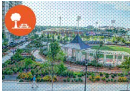
Parks & Public Space