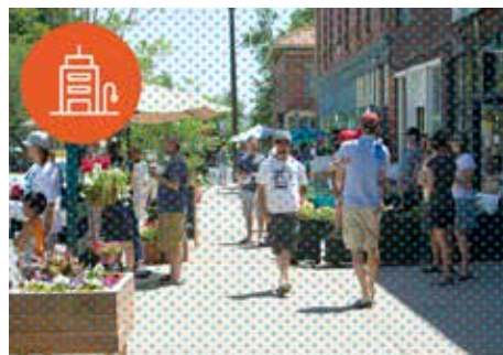
Streetscape & Urban Design