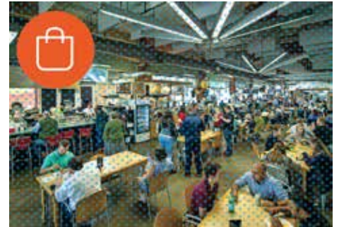
Food & Retail