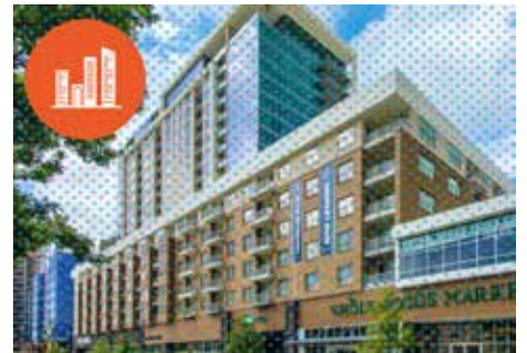
Housing & Development