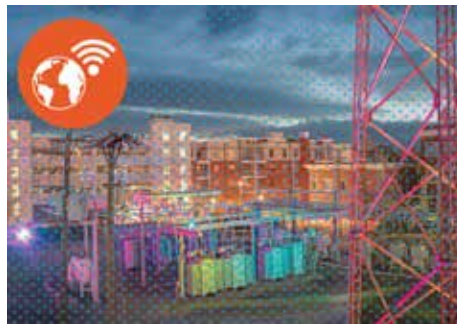
Sustainability & Technology