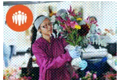
Social & Cultural