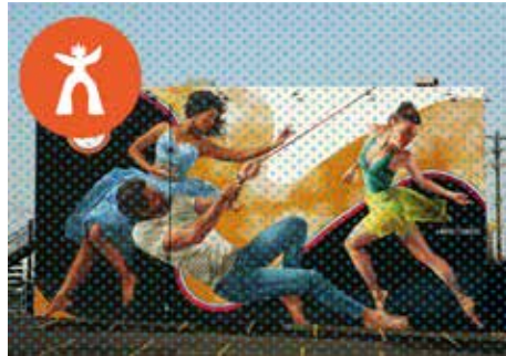
Arts, Sports & Entertainment